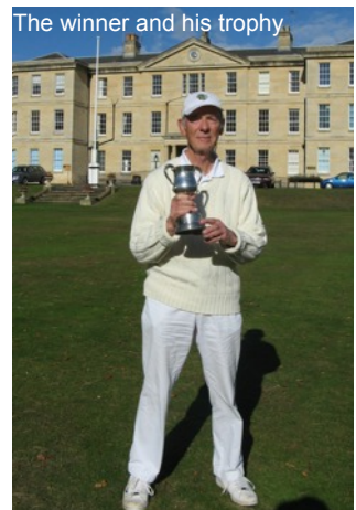
The winner and his trophy