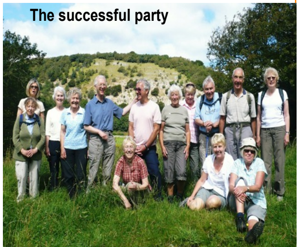
The successful party

Tuesday dawned sunny and warm and we set off on the train from Grange-Over-Sands, some of the Group getting off at Arnside and some at Silverdale. The longer walk started well but once into the woods things got tricky! It was a case of not seeing the wood for the trees so to speak and the leader appeared to be directionally challenged or as some of the group would insist on saying. LOST!