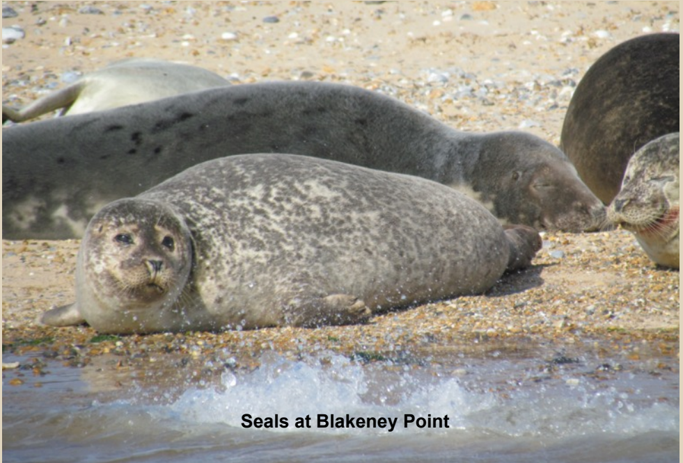
Seals at Blakeney Point