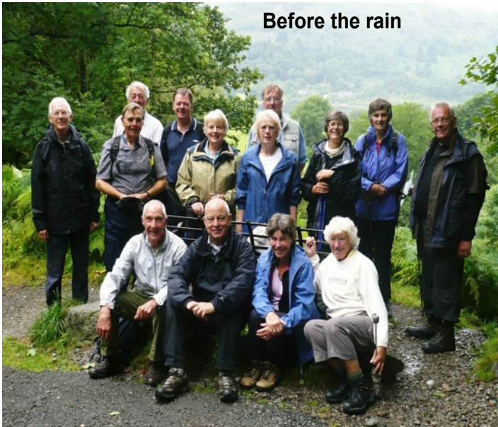
Before the rain

Wednesday was to be "A once in a lifetime opportunity to walk from Hest Bank across Morcambe Bay to Grange". We should have believed the weather forecast because it poured down and windy with it. The walk, needless to say, was cancelled. For some strange reason no one seemed unduly disappointed. A group of eight did however walk from Cark to Cartmel and got very wet in the process.